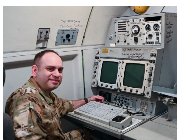
Rabbit Tales // 4 // April 2023